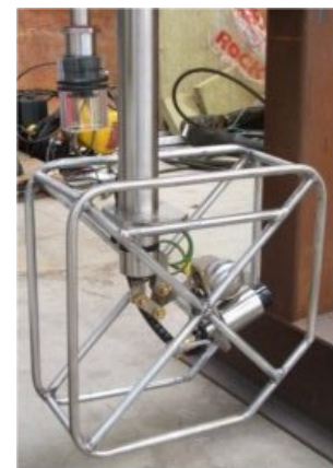
Gas detector with video camera and light

Cleaning of service station underground fuel tanks remotely and safely