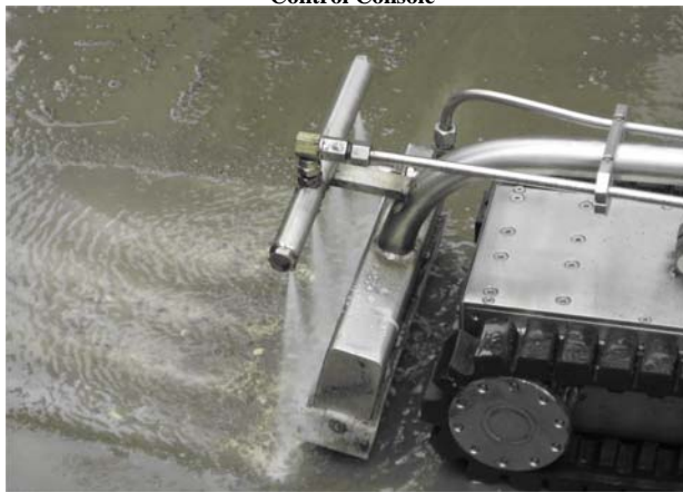
HP Jetting Ramp